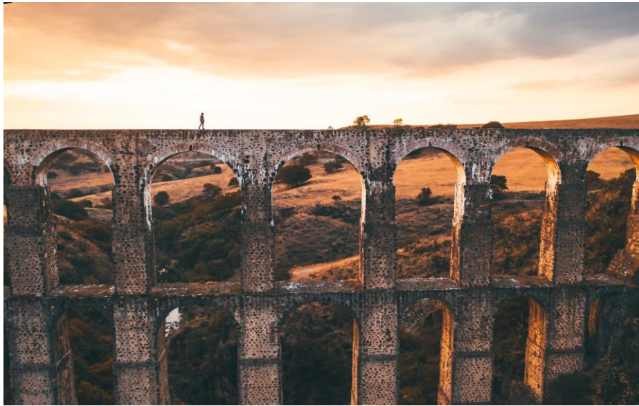
Figure 4: Arches of an Ancient Building