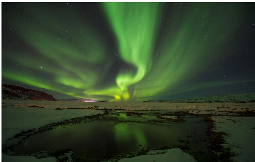
Figure 1: Rene Rossignaud (2017) (Source: rossignaud.com)