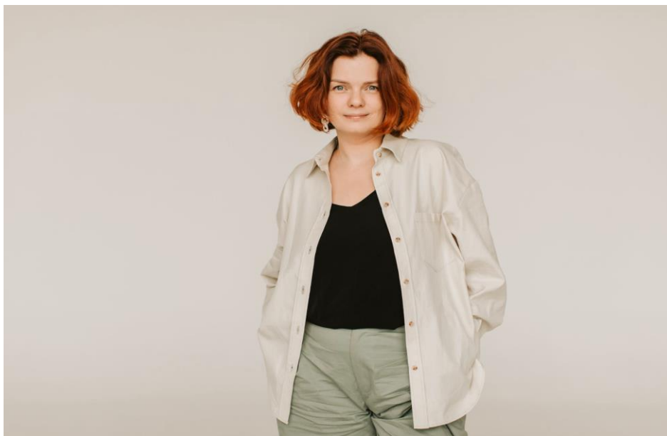
Figure 3: Beautiful Woman in Long Sleeves Polo