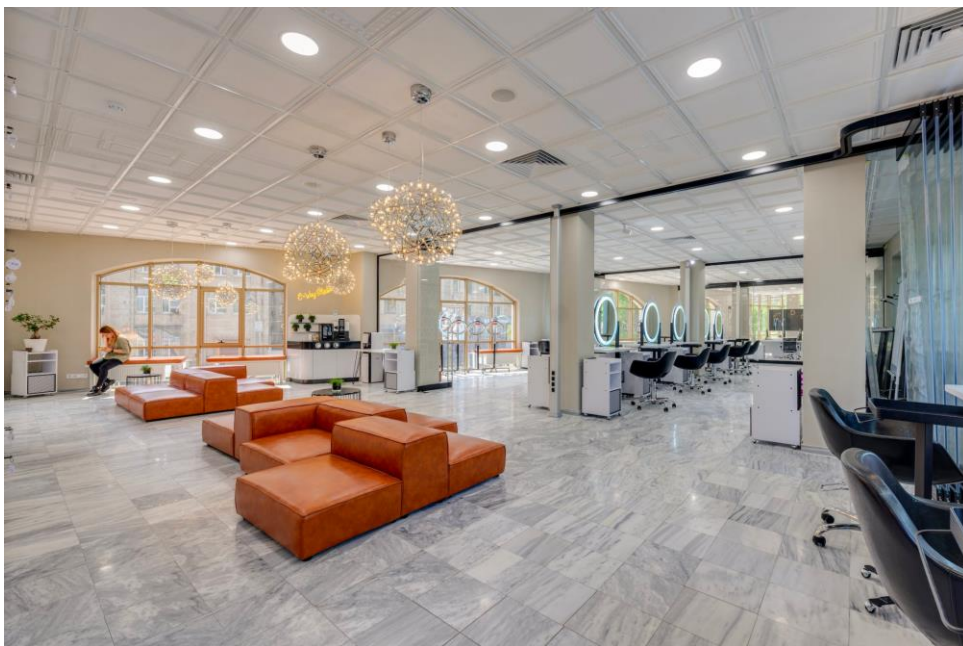
Figure 5: Interior Shot of Beauty Salon