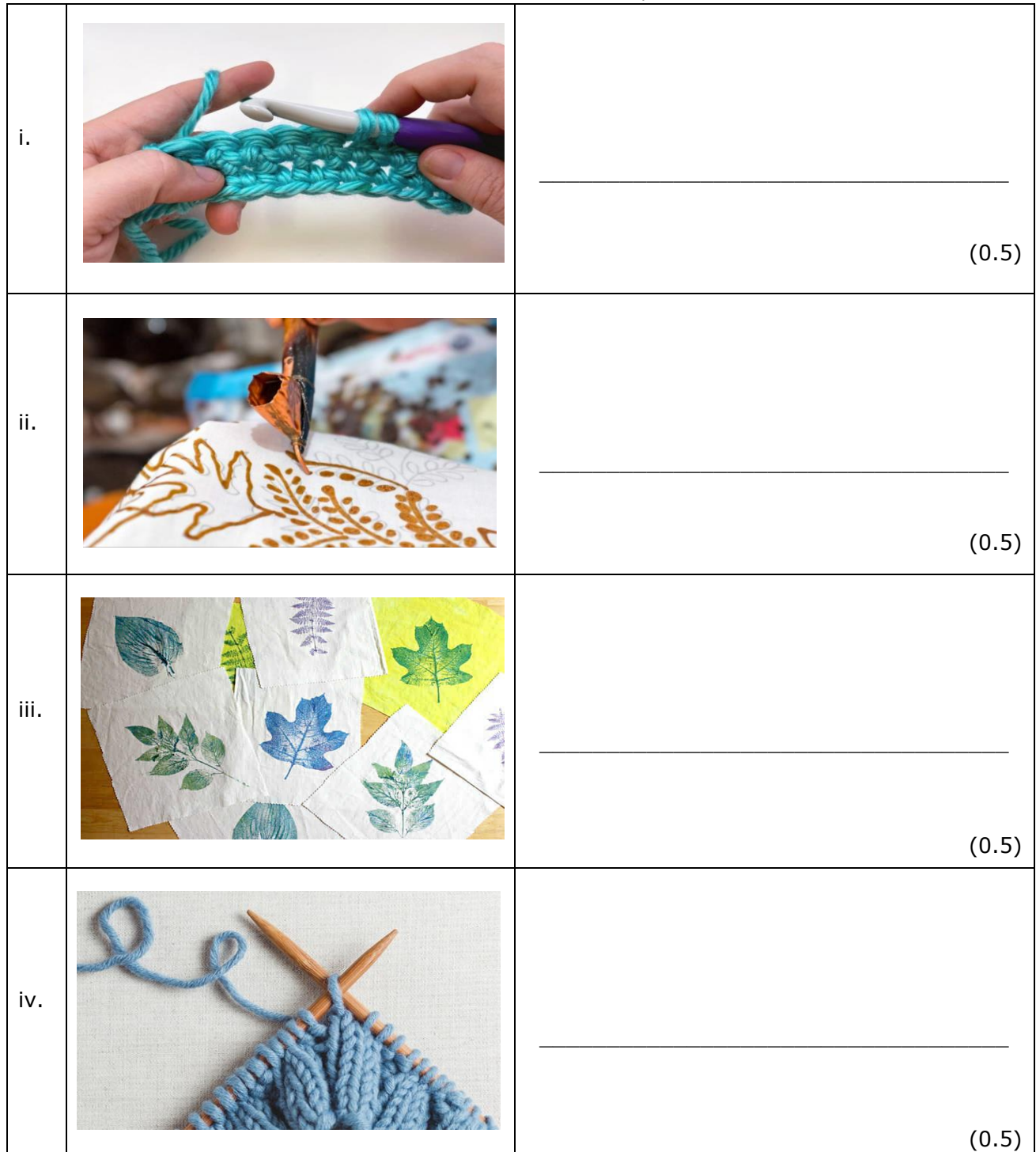
Table 3: Creative Textile Techniques

a. Label the FOUR creative textile techniques shown in Table 3.