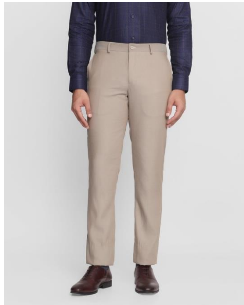
Figure 2: Trousers