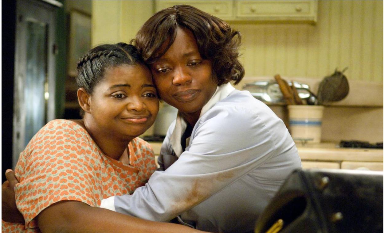
Figure 4: The Help . (2011). [film] Directed by Tate Taylor. USA: Walt Disney Studios Motion Pictures.

a. Outline TWO mise-en-scène elements found in Figure 4.