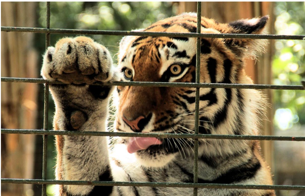
Figure 2: Image of Tiger

Explain ONE positive and ONE negative reaction of different audiences upon seeing this image.