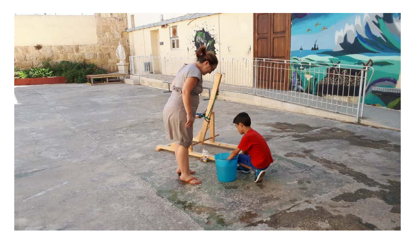
The Science behind physical exercise