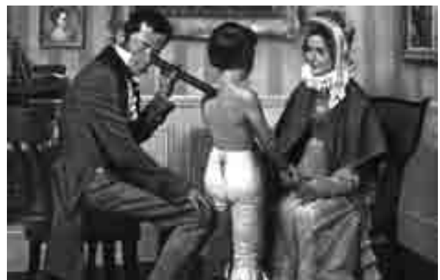
Figure 2: Laënnec auscultating a child's back with his stethoscope

Electronic stethoscopes have been available for quite some time, but these devices per se have generally provided only a minimum level of improvement over their mechanical predecessors. Other disadvantages include their expensive retail price, the frequent complaint of 'background noise', and that although described as 'electronic', most of the devices cannot interface with computers; but with the recent advancements in technology, these limitations are rapidly decreasing. Costs have